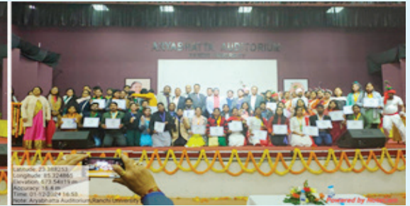
Participants with awards