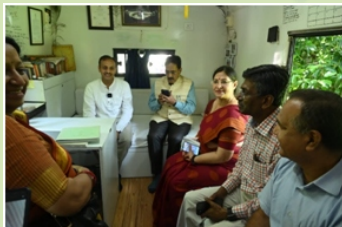
Hon'ble Vice Chancellor along with IQAC members inside the Solar Bus