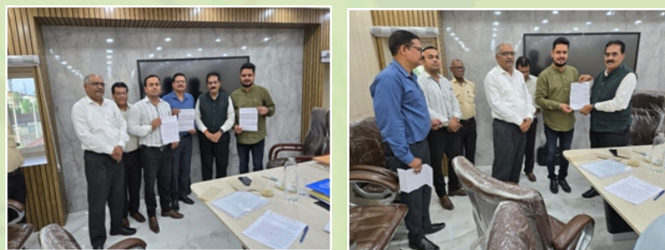
Distribution of Appointment Letter to the Faculty Members of Vocational Courses by the Hon'ble Vice Chancellor

Appointment of Contractual Faculty for Vocational Courses: Ranchi University appointed new contractual faculty members for various vocational courses like BBA, BCA and MCA. This move aims to enhance the quality of teaching and support specialized programs that contribute to student employability and skill development.