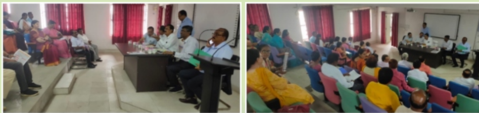
Hon'ble Vice Chancellor along with Ranchi University Officials at the Review Meeting with all the Heads of University PG Departments at Seminar Hall, University Department of Geology, Ranchi University, Ranchi